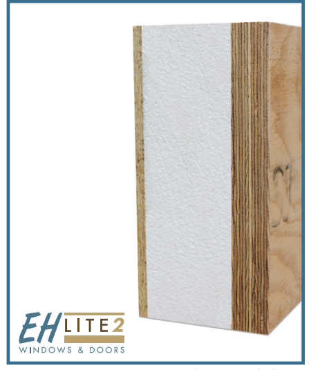
5-1/2'' pictured above. LVL side should be installed facing out.